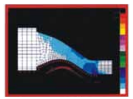
Electric field analysis